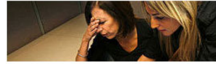
Web 101: A New Model For Women In The Workplace