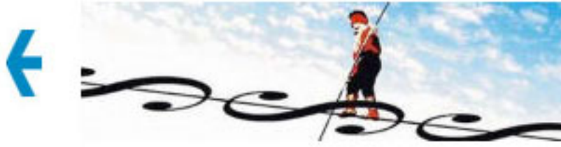
The Myth Of Stability

COMEDY 23/6 VIDEO BLOGGER INDEX ARCHIVE Get Email Alerts Make HuffPost Your Home Page